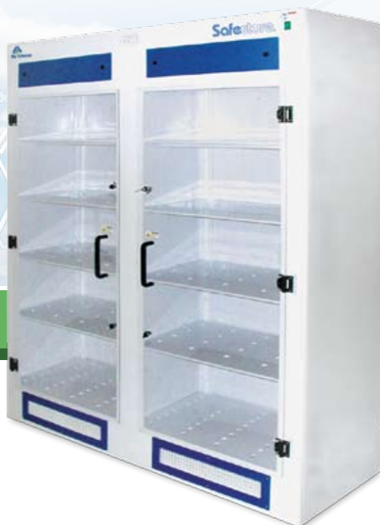
— Safestore™ 64T